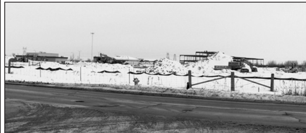
Innes Road between Lanthier and Mer Bleu. A Loblaws Superstore will anchor this development.