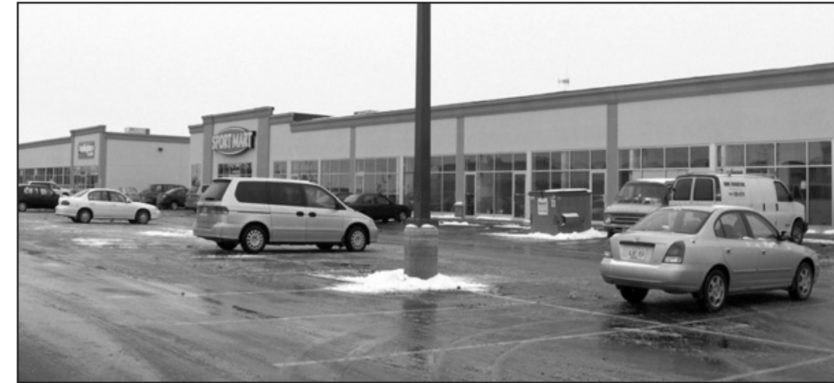
Tenth Line Road at Innes. A major development that will complement the stores of Trinity Common, which is right across the street. Farmboy, SportMart and Beddingtons are a few of the major-name stores to anchor this retail service area.