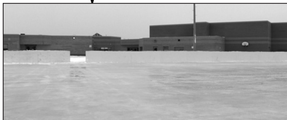
Jeanne Sauvé School - Gardenway