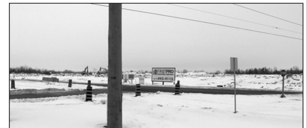
Innes at Belcourt. WalMart will be moving from Place d'Orleans to anchor the FirstPro shopping centre.