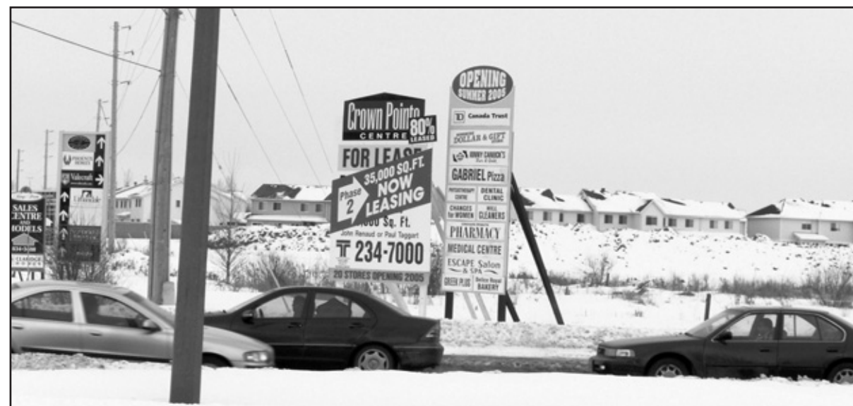
Trim Road at Watters Road. Development has started on the Crown Pointe retail/services centre that includes a long list of confirmed tenants.