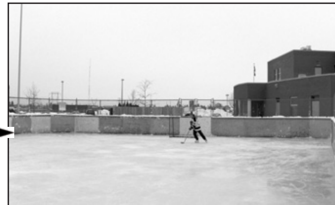
Maple Ridge School