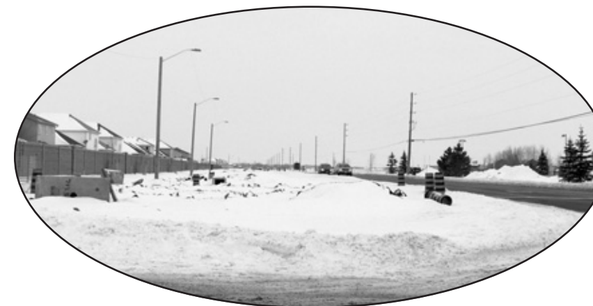
Innes Road Widening to four lanes is the promise that all of this new retail development will not lead to traffic congestion problems.